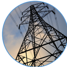
Government & Infrastructure